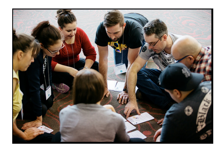
The County Fair – A Virtual Teambuilding Activity from Teamwork & Teamplay

Begin by emailing, texting or sharing each of the following clues to a different member of your group. Then, using an audio or video conferencing app (such as FaceTime, Skype, Zoom, WeChat) see if your group can solve the mystery by working together.